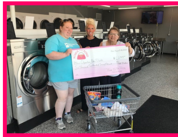
Operation Clean Duds Laundry Events & Supplies - $6,275