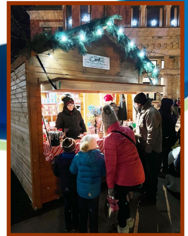
Bryan Development Foundation Christkindl Market Expansion - $20,000