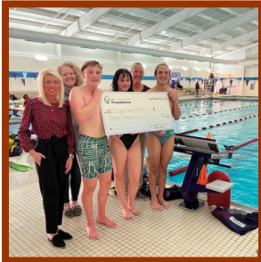
Bryan Swim Team Association Diving Board Replacements - $2,500

Founders Grants, which are grant requests of $2,500 or less, have an abbreviated application and faster approval process than traditional competitive Bryan Area Foundation grants. This past fiscal year, we received and approved ten Founders Grant requests, offering nonprofit organizations the opportunity to further their mission to serve Williams County.