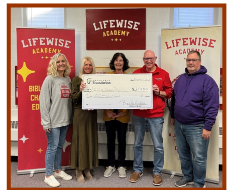
LifeWise Academy - Bryan Vehicle Purchase - $25,000