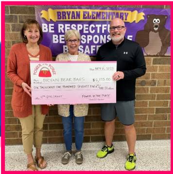
Bryan Bear Bags

Our Power in the Purse (PIP) members know how to have fun while raising awareness and funds for Williams County non-profits. Now in its ninth year with 96 members and 8 sponsors, this all-women's giving circle has given more than $213,000 to 38 nonprofit projects.