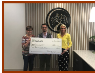
Fountain City Festival Newsies the Musical - $2,500