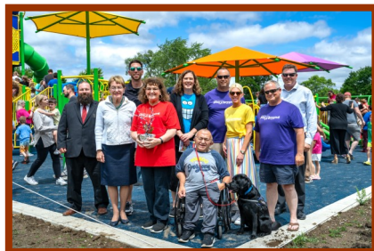
City of Bryan Parks & Recreation Lincoln Park Inclusive Playground Grand Opening - $2,500