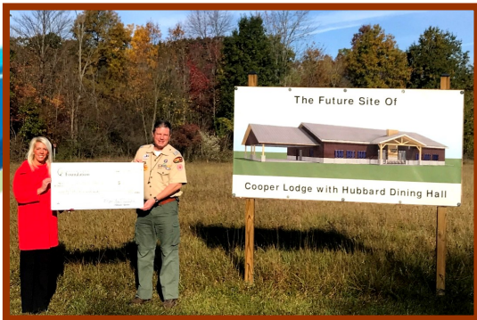
Black Swamp Area Council Boy Scouts Camp Lakota Lodge & Dining Hall Project - $25,000

Community & Field of Interest Funds made these grants possible in 2024!!!