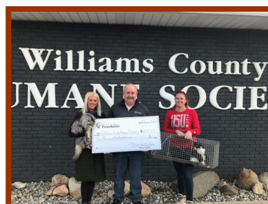
Wms. Co. Humane Society Cat Program - $2,500