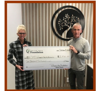
CPC Womens' Health Resource Earn While You Learn Program - $2,500