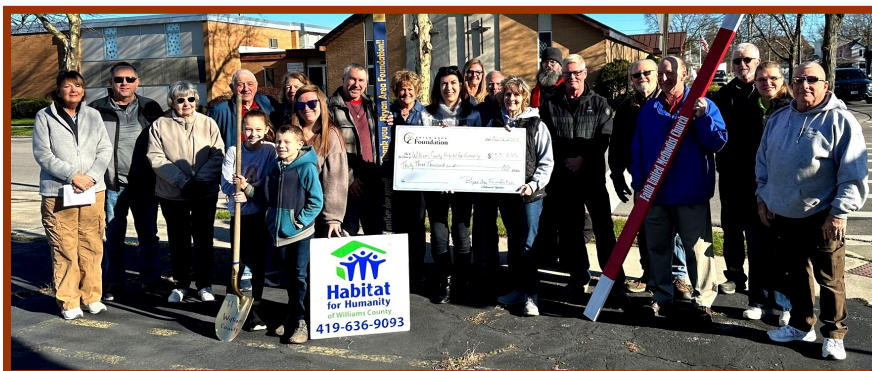
Williams County Habitat for Humanity 2024 Build - $33,000