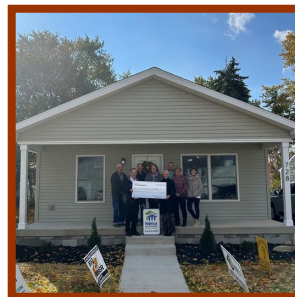
Wms. Co. Habitat for Humanity Flooring for New Build - $2,500