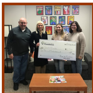
Sarah's Friends Office Lighting - $2,500