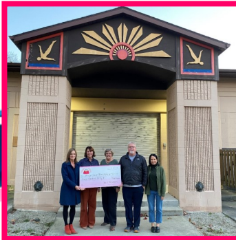
Bryan Swim Team Association New Heating Equipment - $750