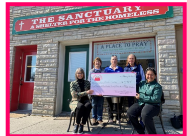
Sanctuary Homeless Shelter Operating Expenses - $6,475