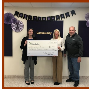
Bryan Elementary Parent Teacher Organization Bear Bag Program - $2,500