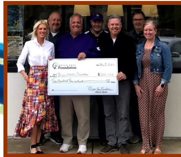
Bryan Athletic Boosters Capital Improvement Project: Phase 2 - $200,000